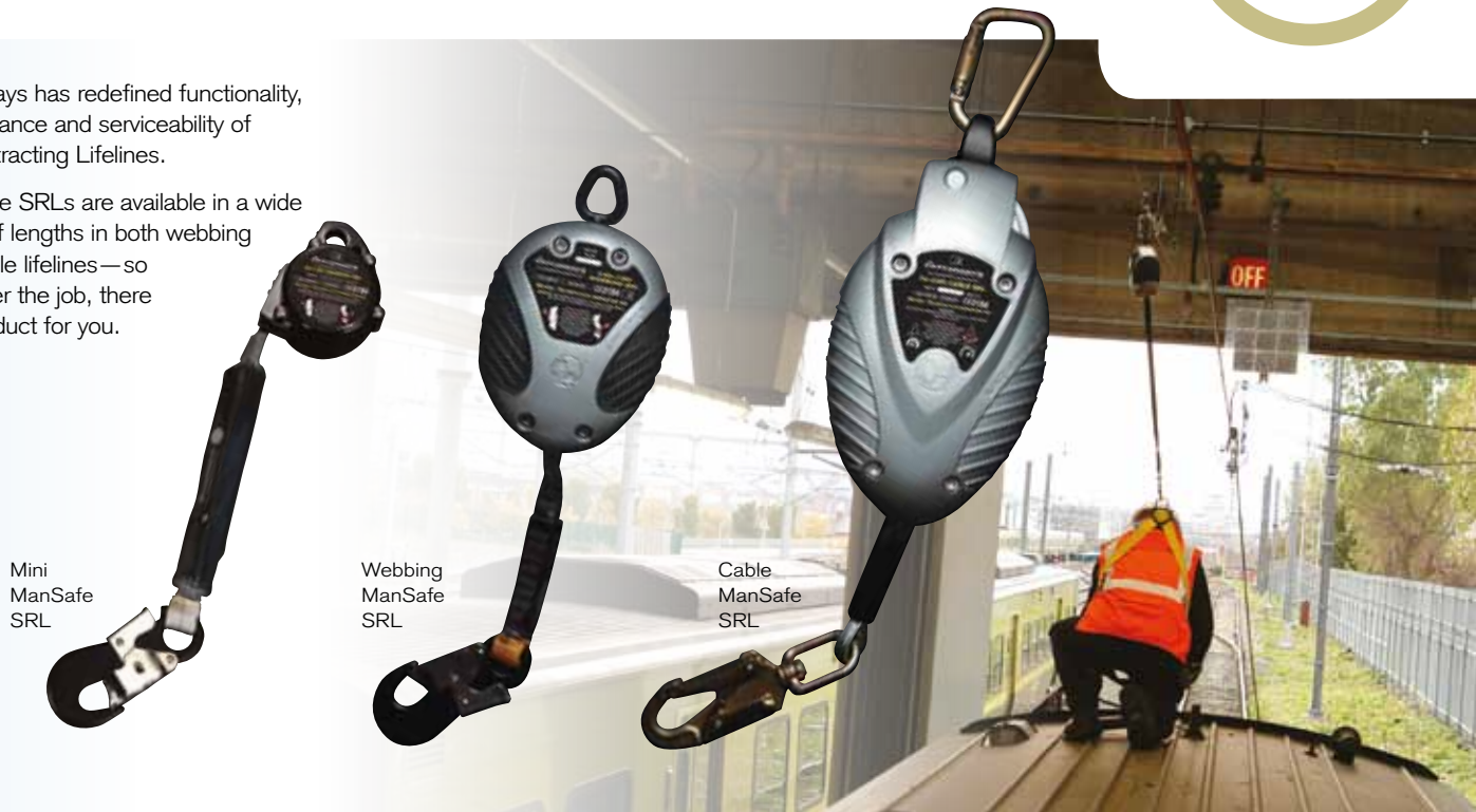
Mini ManSafe SRL

ManSafe SRLs are available in a wide range of lengths in both webbing and cable lifelines— so whatever the job, there is a product for you.